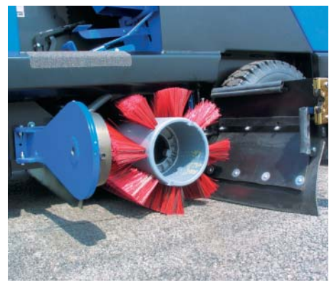
Broom maintenance is kept to a minimum with the swing-out idler arm and no-tool broom removal features.