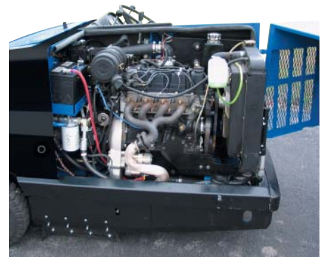
Available engine choices include Ford EFI gas, LP or Mitsubishi diesel. Meets EPA requirements through 2007.