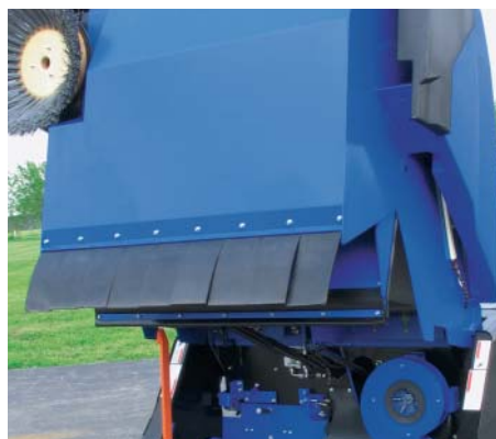
Versatile dump system dumps from ground level up to 60 in. eliminating second handling of debris.