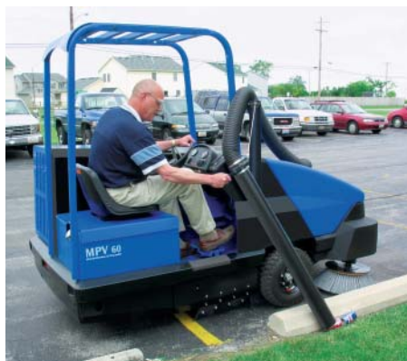
Choose the optional Littervac™ if you need to remove leaves, cans and paper from behind car stops and along fence lines.