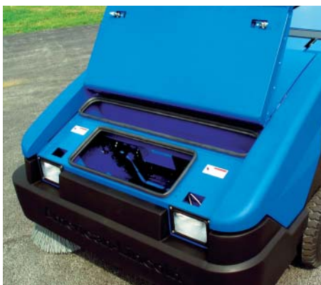
Extra-large door to 14-cubic-foot hopper permits easy removal of large items often left behind.