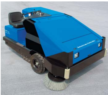
Total steel models operate in the harshest conditions with a minimum of maintenance.